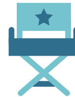
ACTORS, DIRECTORS & MEDIA

Our specialised services have been designed in direct response to the needs of international athletes, entertainers and their families: